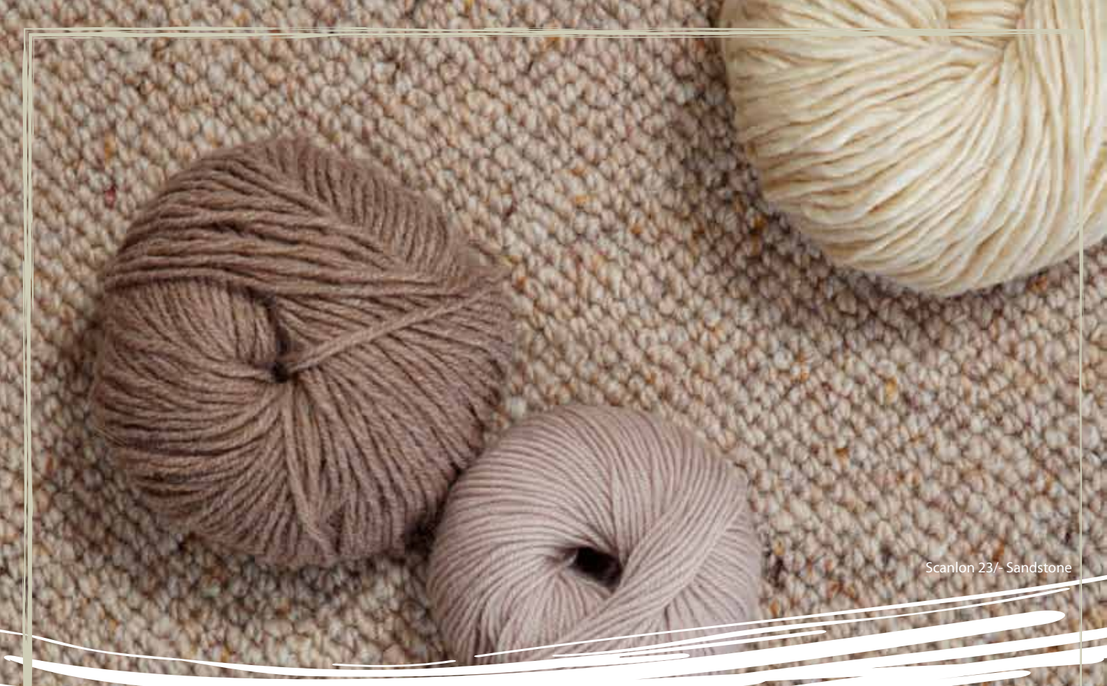
Scanlon 23/- Sandstone

To find your nearest Feltex, Feltex Reserve or Feltex Classic retailer, contact: